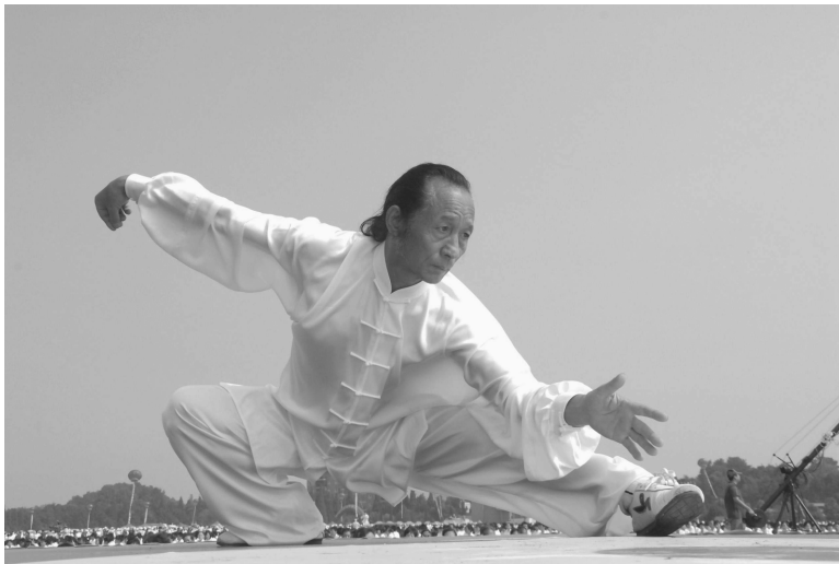
FIGURE 5.2 Taijiquan .