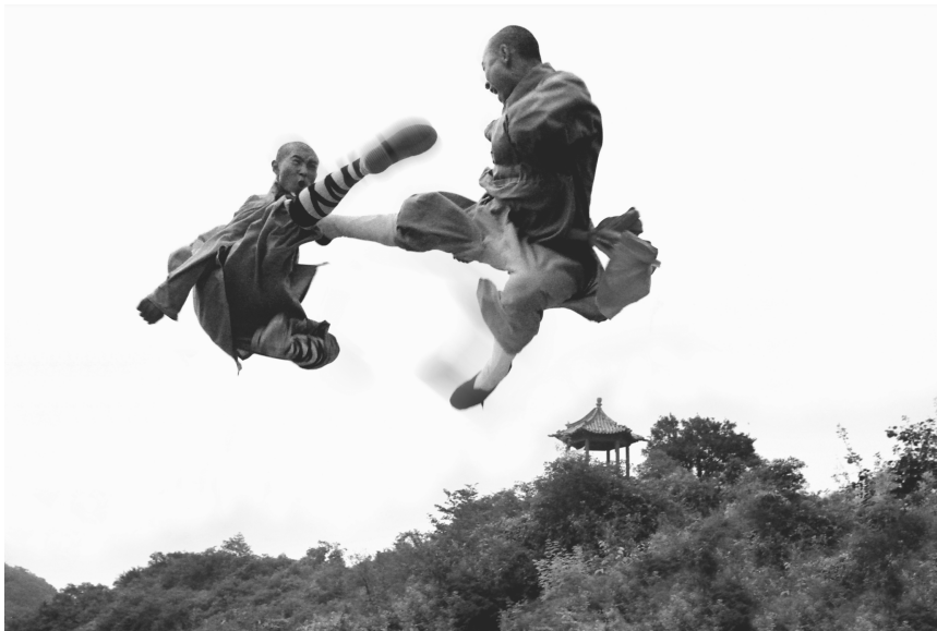
FIGURE 5.1 Shaolin flying martial arts.

What is the secret of Chinese martial arts? A related question is, why are we talking about martial arts in a book about religion? So Huo Yuanjia had a better fighting technique. So he was a man of integrity. Is there anything religious about that? To be sure, in the film Fearless , as in many martial arts courses and academies today, there are no visible signs of religion. Indeed, Huo Yuanjia himself was a founder of the first modern martial arts association, the Chin Woo Athletic Association, that gave itself the mission of erasing any trace of religion or superstition from kung fu. But if we look at other kung fu films, such as Crouching Tiger, Hidden Dragon , we see plenty of scenes of fighters flying through forests, running on the surface of lakes, using all sorts of magic, and encountering old wise men, Daoist wizards and Buddhist masters, who hold the secrets of defying the laws of gravity. Indeed, the two most famous centers for martial arts training in China, Shaolin and Wudang, are respectively a Buddhist and a Daoist monastery. In these traditions, martial arts are a form of spiritual discipline. “Soft” methods like taiji-quan (known in the West as tai chi) are now practiced by millions around the world,