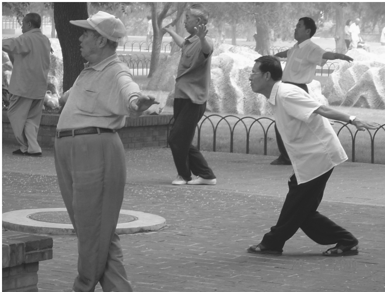
FIGURE 5.3 Qigong practitioners in a Beijing park.

In all of these examples, we see people practicing traditional disciplines for training the mind and body, with the hope of improving their health, increasing their mental and physical powers, and attaining higher spiritual states and levels of wisdom. Unlike in the West, where individual body disciplines such as workouts, weight training, swimming, or running are quite mechanical, and are not seen as organically connected to other aspects of life, what we see with these Chinese traditions is that these technologies—which all involve, in some way or another, harnessing the cosmic powers of qi —are quite readily connected with mystical experiences,