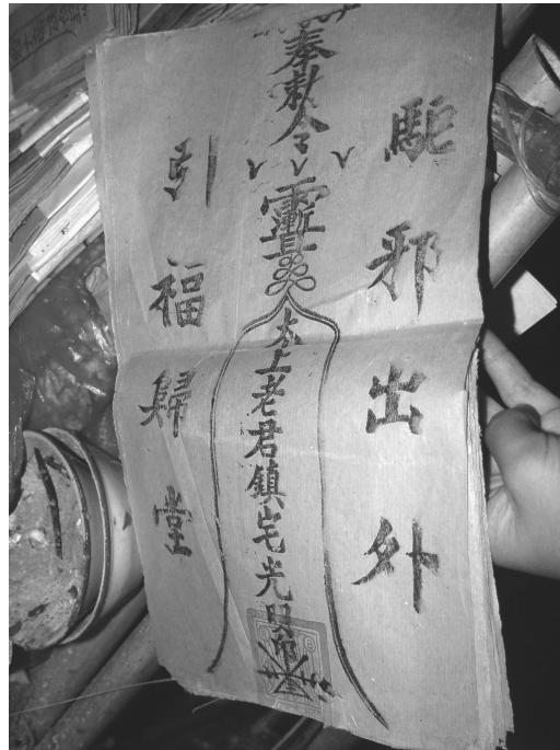
FIGURE 5.5 Daoist talisman.

Chinese cosmology is more concerned with processes and patterns than with substances. The world as we experience it is the ephemeral expression of the ever-evolving unfolding of processes and the interrelation of forces and energy flows. The types of question this worldview gives rise to are of this type: What is the tendency? What type of process are we in? How are different processes interacting and how does this affect the overall pattern?